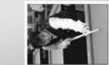
Sonny Cho Former USA Champion