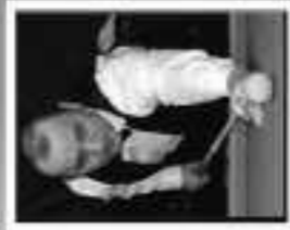
Hugo Patino Two time USA Champion